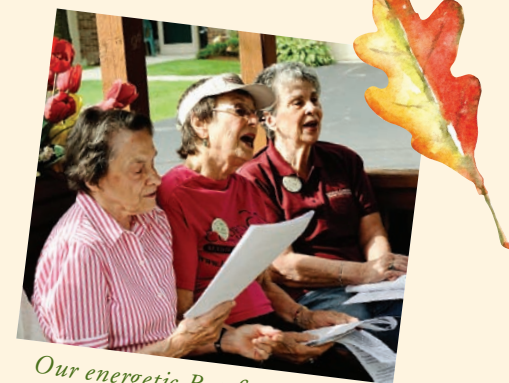
Our energetic Botsford Boosters singing