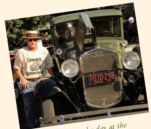
Fun drives the day at the annual Botsford Cruise-In.