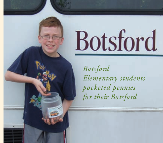
Botsford Elementary students pocketed pennies for their Botsford