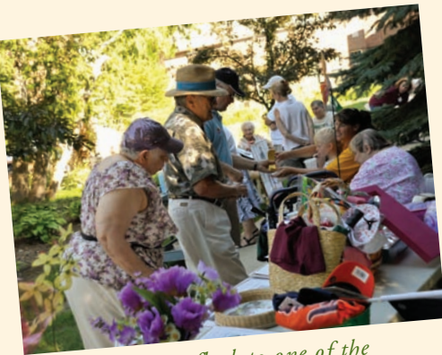
Residents flock to one of the many colorful fundraisers.