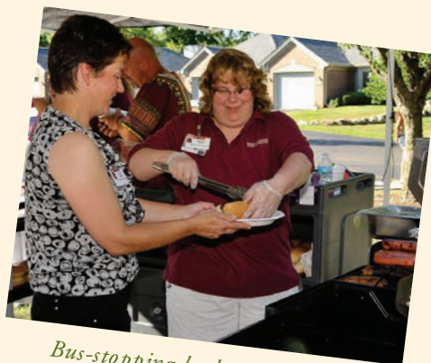
Bus-stopping barbecues brought employees out for the cause.