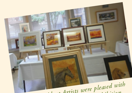
Our Resident Artists were pleased with the success of the recent exhibition

12th Annual Solutions for Family Caregiver Expo Sponsored by The Area Agency on Aging 1-B | Saturday, Oct. 15th, 9:00 a.m. – 2:00 p.m. | Suburban Showplace Collection, Novi.