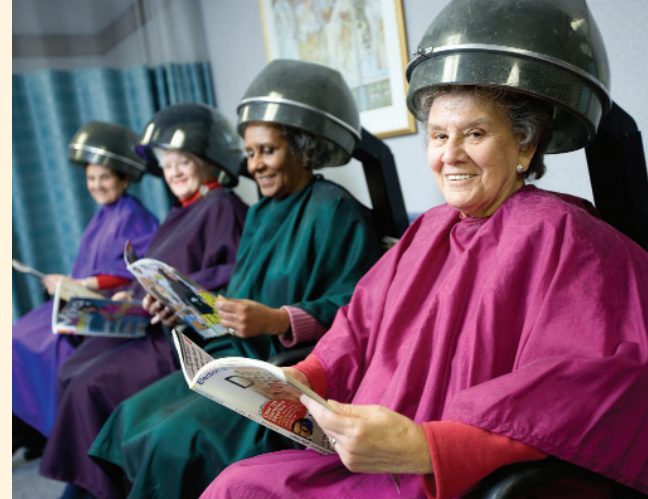
For these gals, the Botsford salon is a girl's best friend.