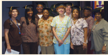
Caring staff graduates from dementia training.

The third component to residents' overall well-being is encouraging family members